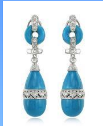
Lots of Jewellery